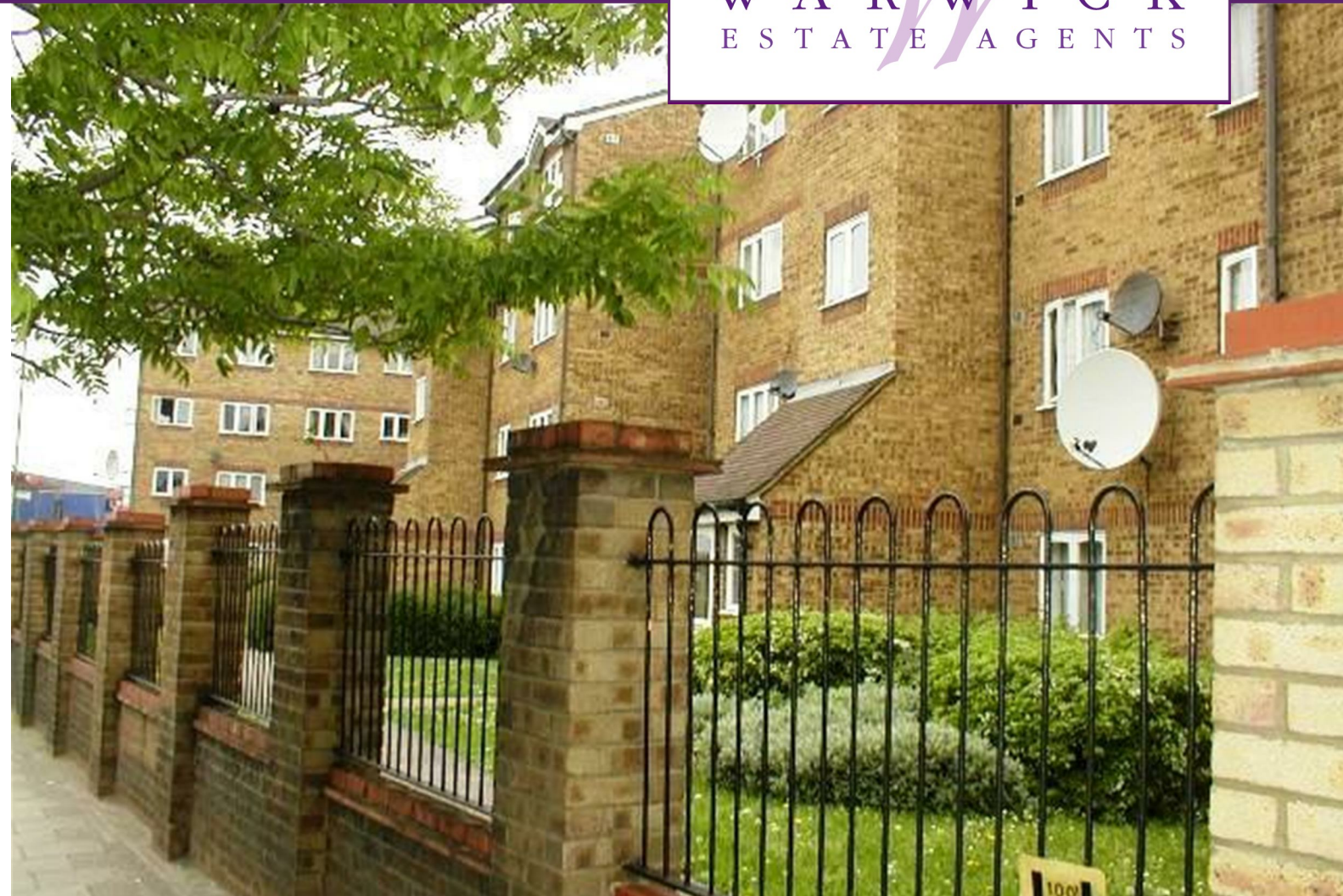
Harrow Road, College Park, NW10 5NB